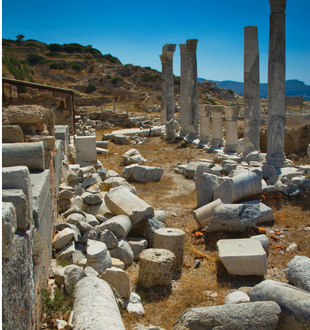
▲ The ruins of Knidos, an ancient Greek trading post on the Datça Peninsula.